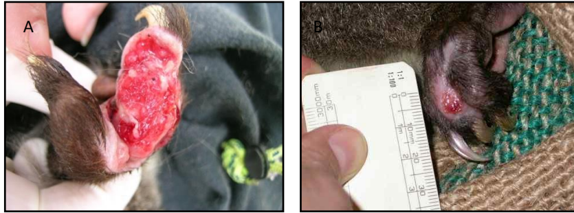
Figure 3. Mountain brushtail possum with lesion (A) at diagnosis and (B) later without treatment.