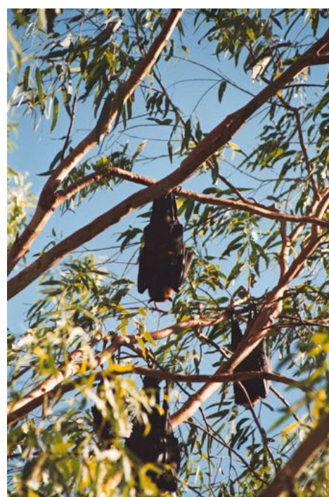
Little red flying-foxes