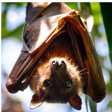
Little red flying-fox