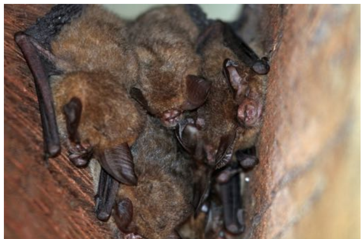
Eastern long-eared bats

REPORT IT TO YOUR LOCAL WILDLIFE SERVICE, VET OR BAT CARER GROUP