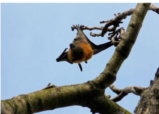
Grey-headed flying-fox

There are no recent surveys on the prevalence of ABLV in wild bats. Surveys of wild-caught bats in the early 2000s indicated an ABLV prevalence in the wild bat population of less than 1%. 2 ABLV infection is more common in sick, injured and orphaned bats, especially those with neurological signs. 3 People are more likely to have contact with bats that are unwell or debilitated, as these bats may be found on or near the ground. 4