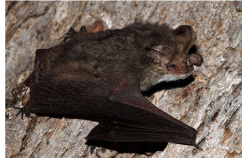
Lesser long-eared bat

Potentially infectious contact with humans was reported for eleven ABLV infected flying-foxes in 2015. In each case appropriate counselling and information were provided by an experienced public health official.