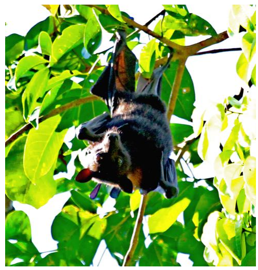
Black flying fox

Wildlife Health Australia collates recent media articles and publications relating to bat health into a monthly 'Bat News' email. If you would like to receive the monthly email, please contact WHA: admin@wildlifehealthaustralia.com.au