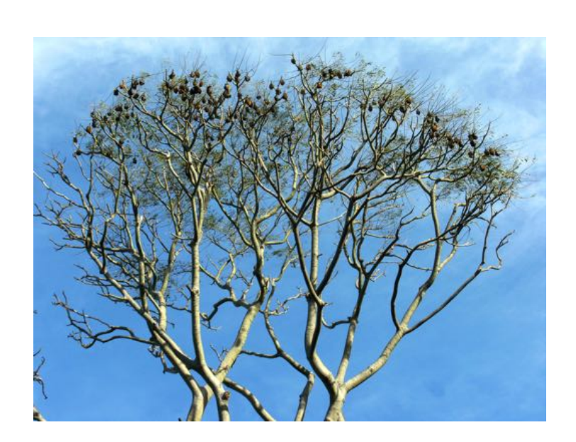
Grey-headed flying foxes

REPORT IT TO YOUR LOCAL WILDLIFE SERVICE, VET OR BAT CARER GROUP