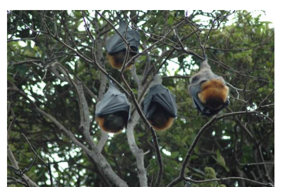
Grey-headed flying foxes