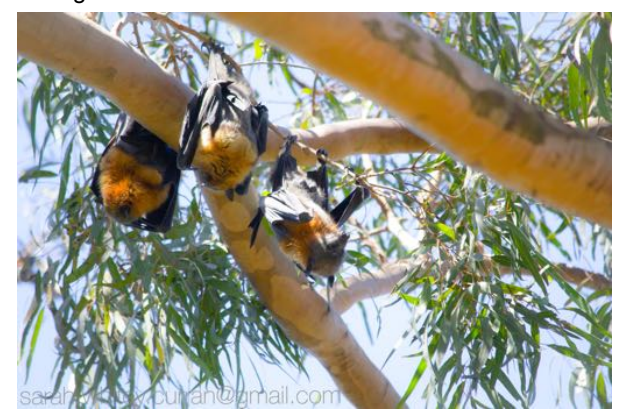
Grey-headed flying foxes

One grey-headed flying fox ( P. poliocephalus ) and one unidentified flying fox ( Pteropus sp.) from NSW were found to be infected with ABLV. The grey-headed flying fox was found solitary and unwell, and was euthanased after it did not respond to treatment. No gross abnormalities were found on post mortem. Histopathology showed nonsuppurative meningo-encephalitis, sialoadenitis (inflammation of salivary gland) and mild pneumonia. The other flying fox was injured and died unexpectedly overnight.