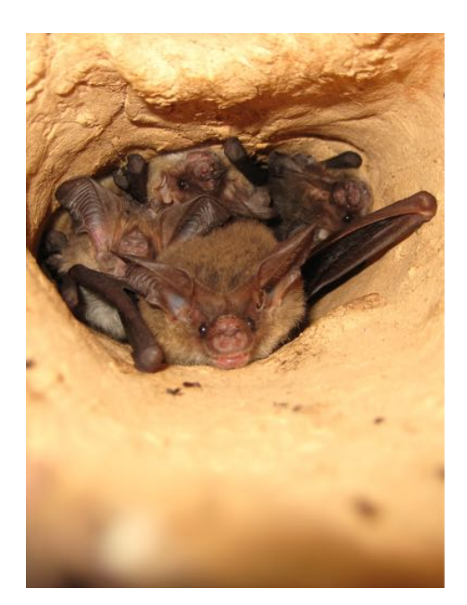
Gould's long-eared bats