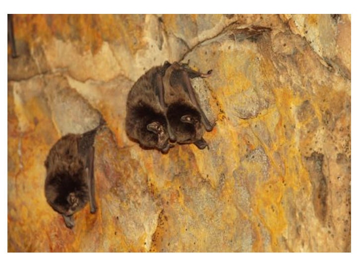
Bentwing bats

Potentially infectious contact with humans was reported for three ABLV infected flying foxes this period. In each case appropriate counselling and information were provided by an experienced public health official.