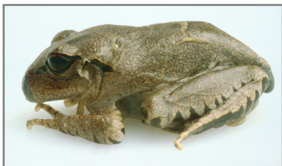
Figure 2. Great barred frog ( Mixophyes fasciolatus ), a lethargic frog with shedding skin accumulating on the body.

Clinical signs resulting from Bd infection can range from fatal to none, depending on host species and life stage. Central nervous system signs predominate behavioural change, slow and uncoordinated movement, abnormal sitting posture, tetanic spasms, loss of righting reflex and paralysis. Skin changes in chytridiomycosis are typically microscopic although abnormal skin shedding occurs (skin shed more frequently and in smaller amounts) and redness may be seen (Figure 2). Following the onset of clinical disease, death may occur rapidly, with severe infections often causing cardiac arrest and mass mortalities.