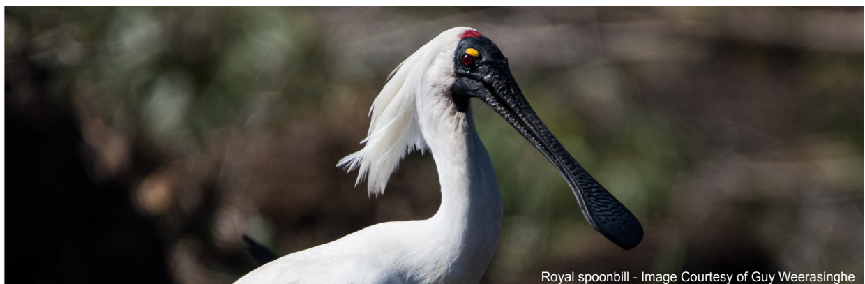
Royal spoonbill

b Disease investigations may involve a single or multiple bird orders (e.g. mass mortality event). The number of events where AIV was tested via PCR against each bird order do not equal the total number of investigations due to multi-species events. During the semester, one wild bird event involved Accipitriformes, Charadriiformes and Psittaciformes orders tested for AIV.