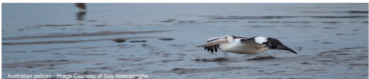
Australian pelican

Avian influenza was not confirmed as the cause of any wild bird morbidity or mortality event between July and December 2022 reported to eWHIS.